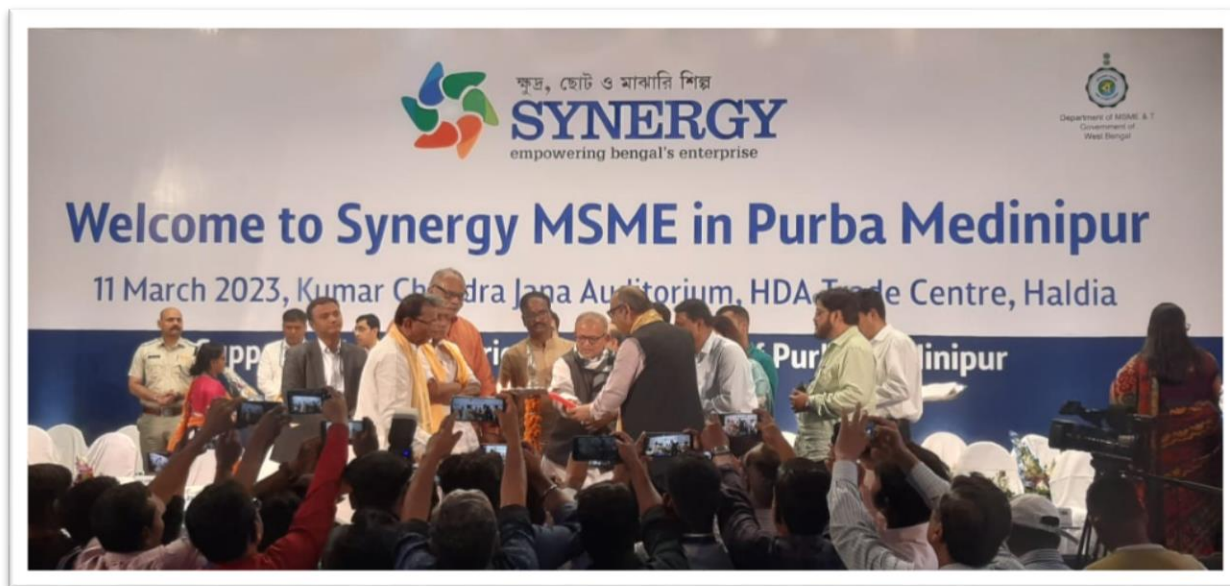
Synergy and Business Facilitation Conclave at Kumar Chandra Jana Auditorium, Haldia, Purba Midnapore