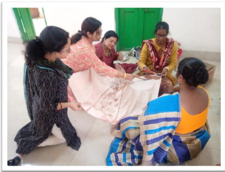
Advance Training Programme on Batik