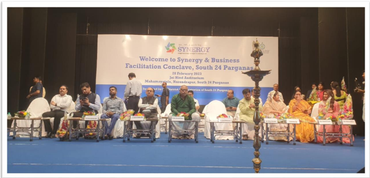
Synergy and Business Facilitation Conclave at Jaihind Auditorium, Sonarpur, South 24 Pgs.