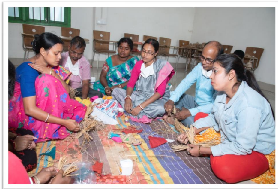
Design Development & Skill Development Programme on Jute Diversified Products