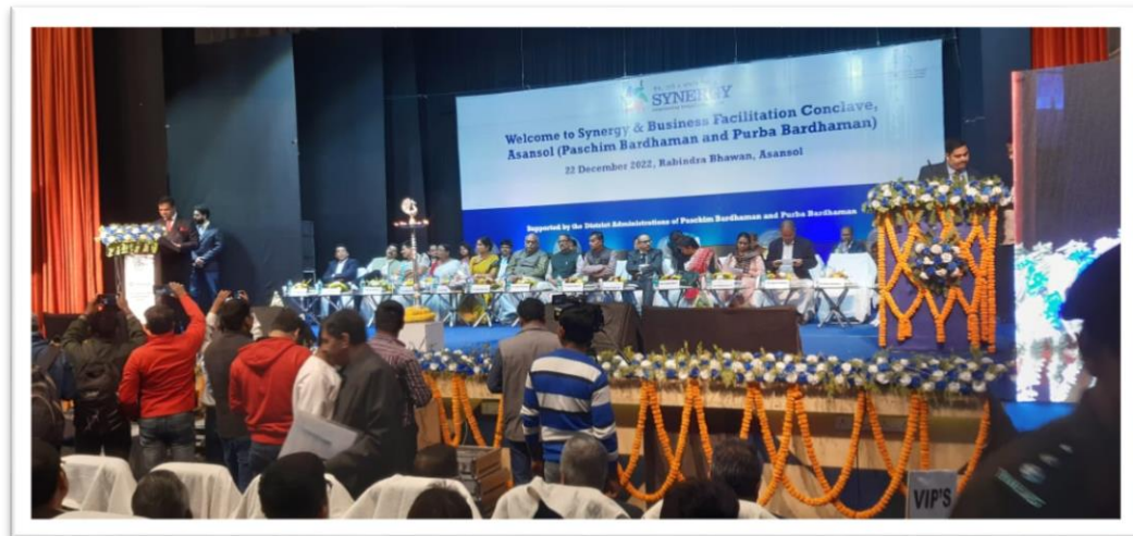
Synergy and Business Facilitation Conclave at Rabindra Bhavan, Asansol, Paschim Burdwan