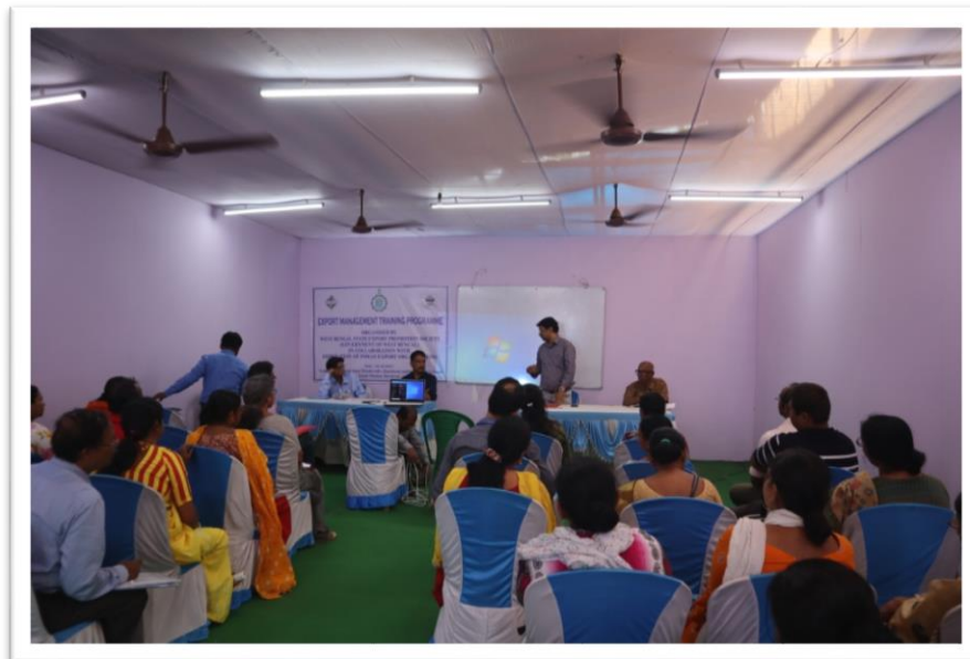
Training Programme on Export Marketing at Burdwan