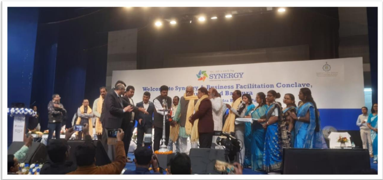
Synergy and Business Facilitation Conclave at Rabindra Bhavan, Purulia