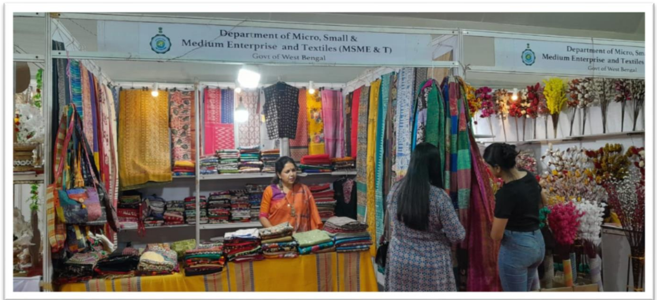
India International Grand Trade Fair at City Square Ground, New Town