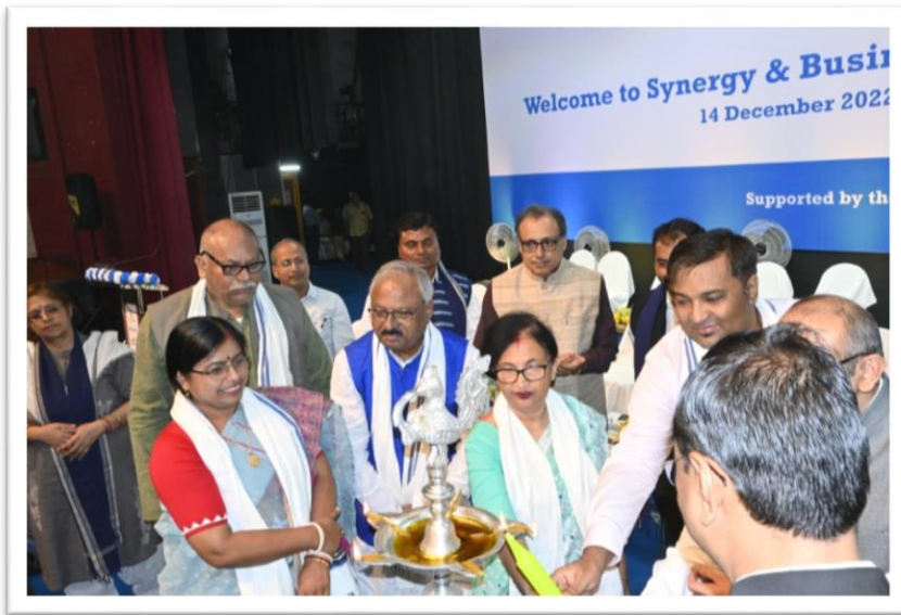
Synergy and Business Facilitation Conclave at Rabindra Bhavan, Dum Dum, North 24 Parganas