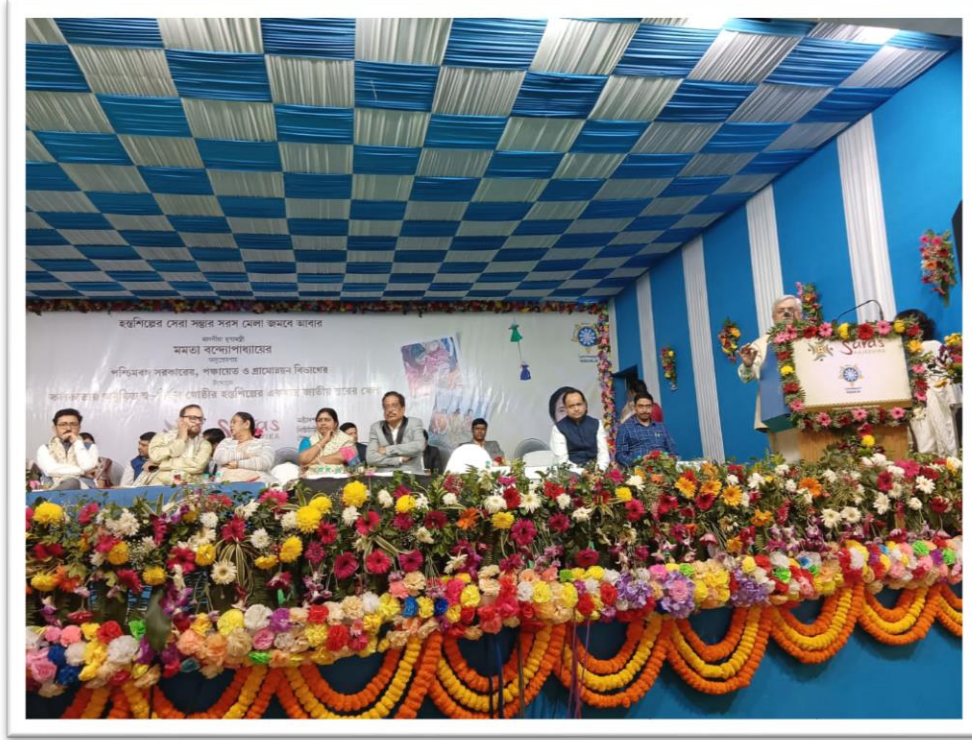
18 th Kolkata Saras Fair 2022-23