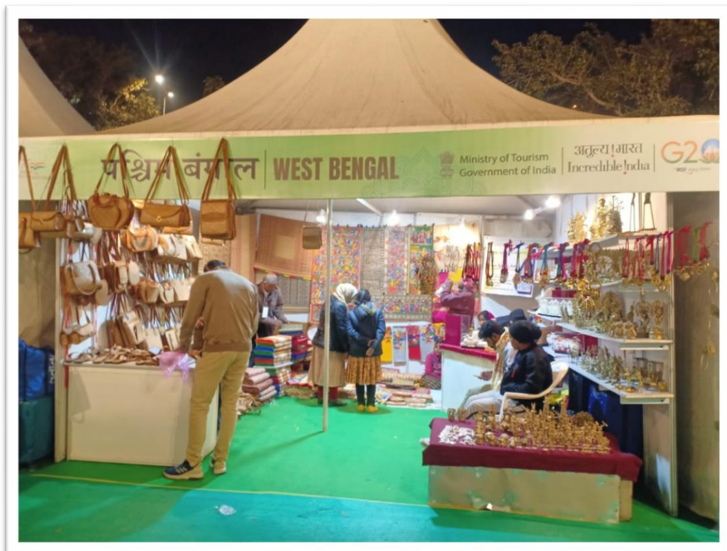
Bharat Parv 2023 at Red Fort, Delhi