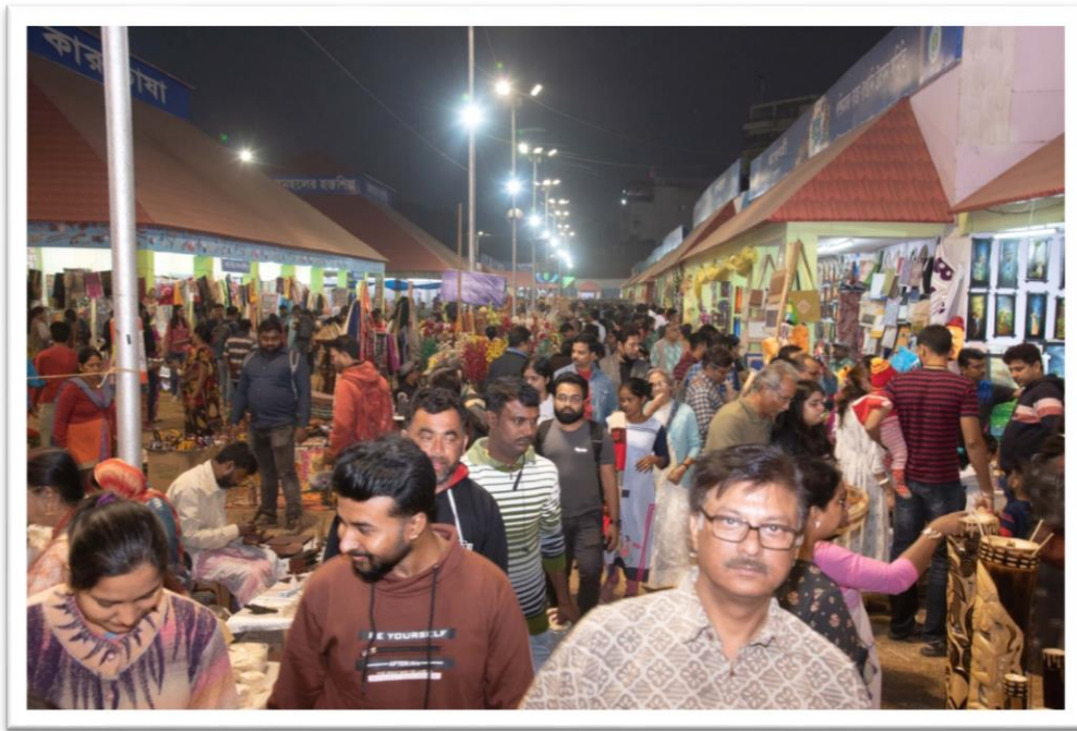
West Bengal State Handicrafts Expo, Kolkata 2022-23