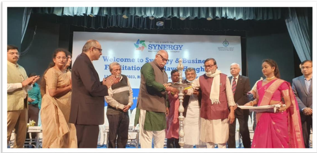
Synergy and Business Facilitation Conclave at Rabindra Bhavan, Chunsurah, Hooghly