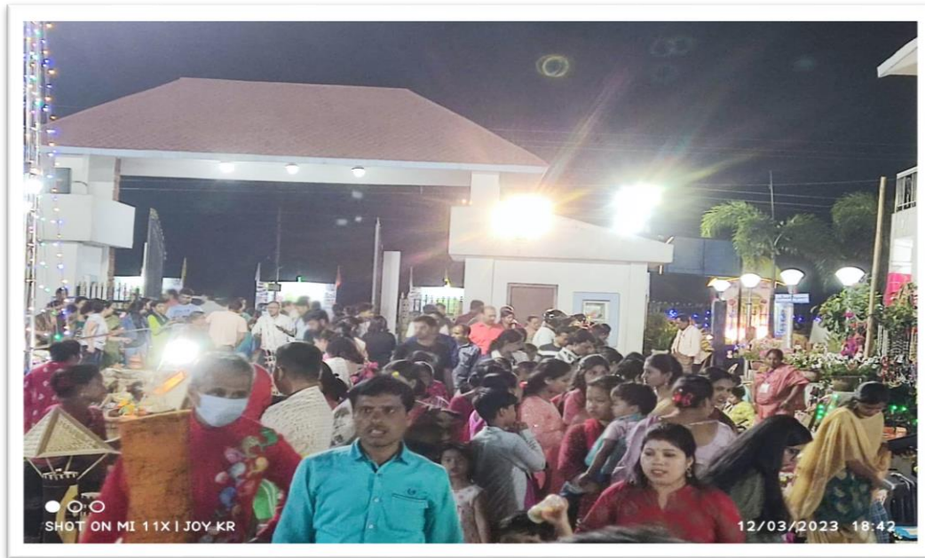
Fair at Biswa Bangla Shilpi Haat, Siliguri 2022-23