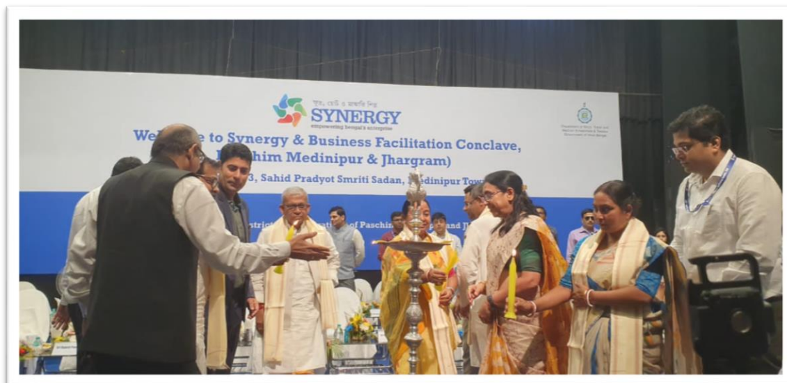
Synergy and Business Facilitation Conclave at Sahid Pradyot Smriti Bhavan, Midnapore Town, Paschim Midnapore