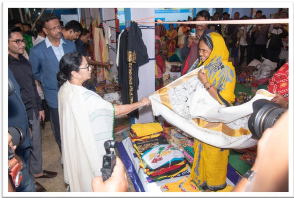
West Bengal State Handicrafts Expo, Kolkata 2022-23