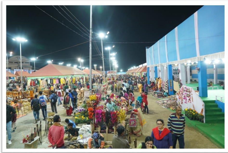
West Bengal State Handicrafts, Handloom & Khadi Fair, Asansol 2022-23