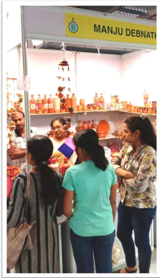
Mango Mela 2022 at Handloom Haat, Janpath, New Delhi