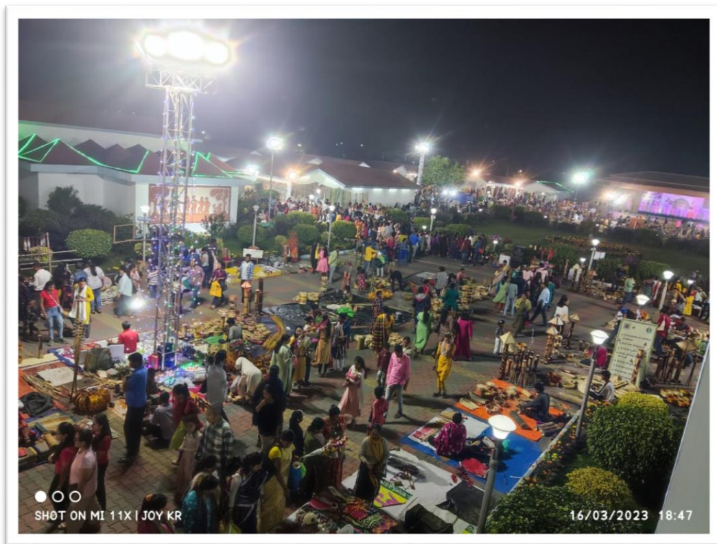
West Bengal State Khadi, Handicrafts and Handloom Expo, B B Shilpi Haat, Siliguri 2022-23