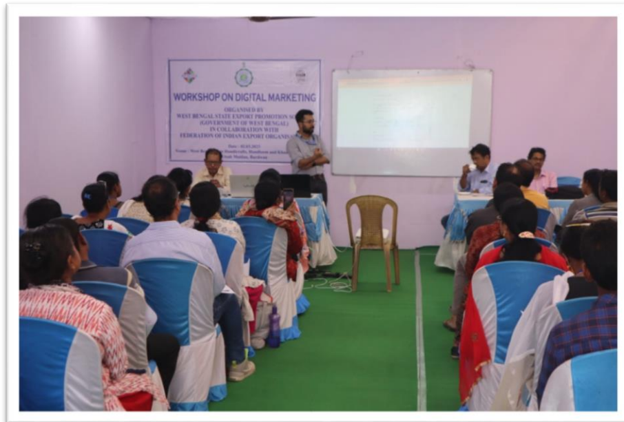
Workshop on Digital Marketing at Burdwan