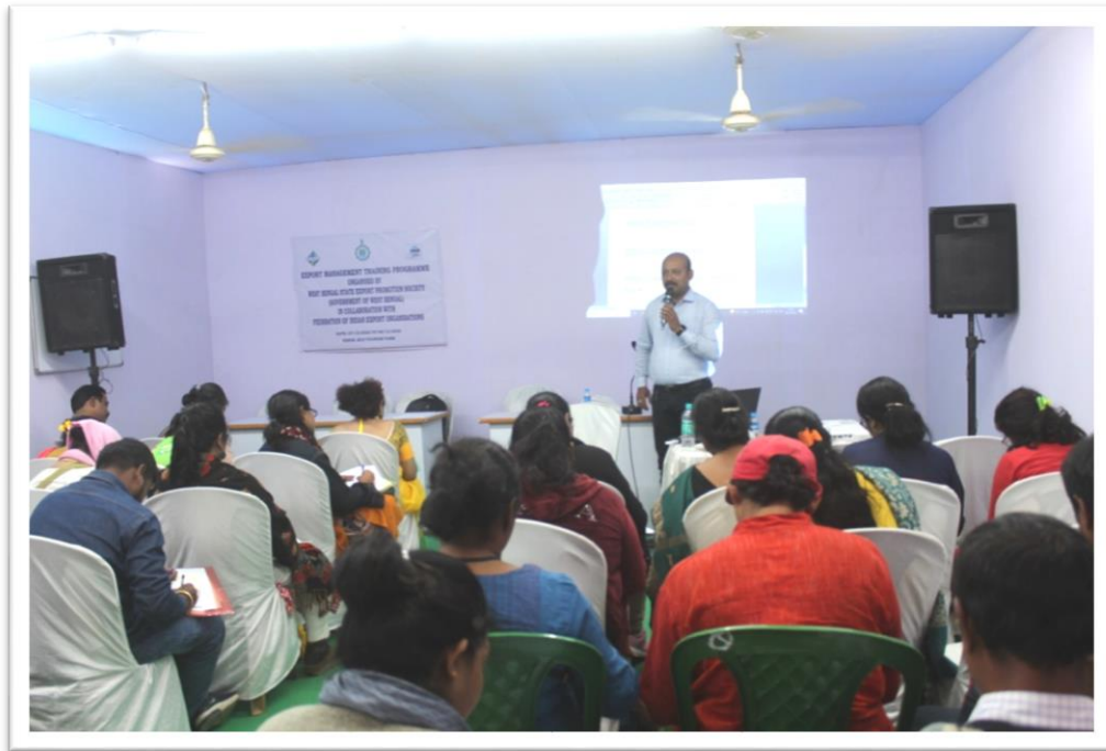
Training Programme on Export Marketing at Kolkata