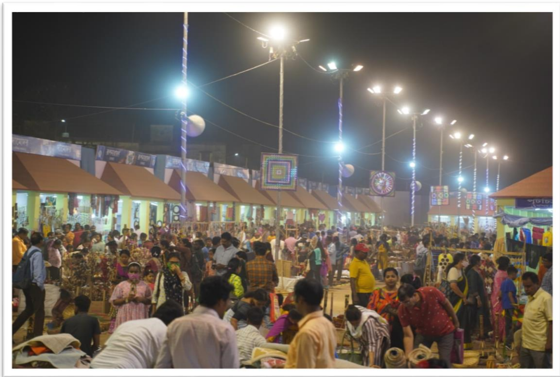
West Bengal State Handicrafts, Handloom & Khadi Fair, Burdwan 2022-23