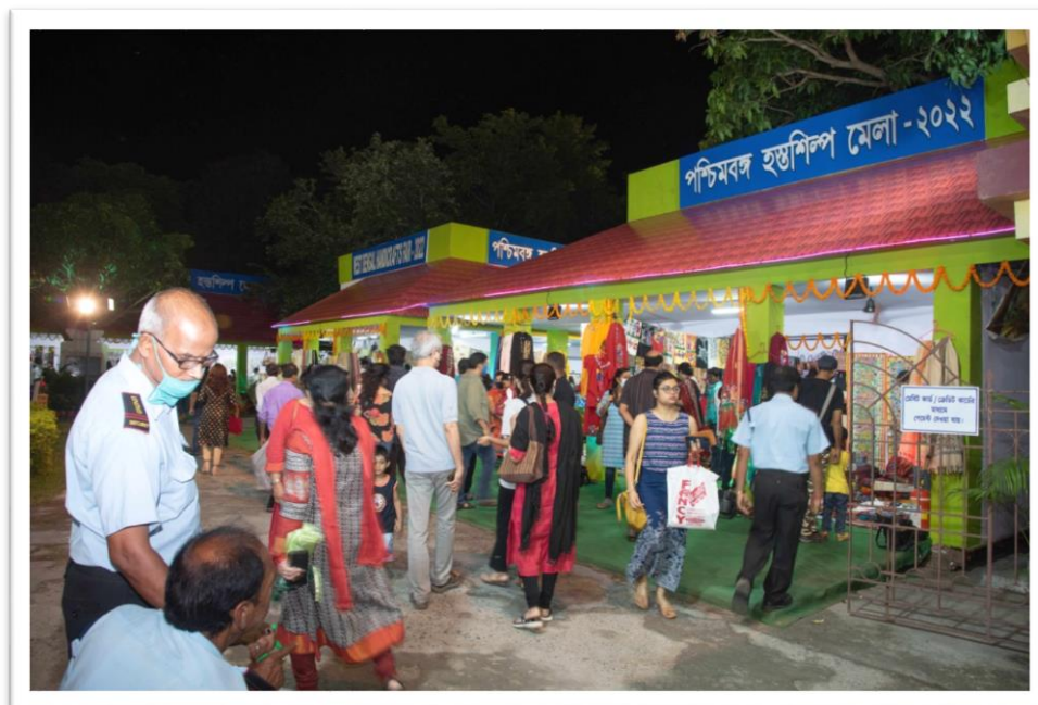
West Bengal Handicrafts Fair at EZCC, Salt Lake