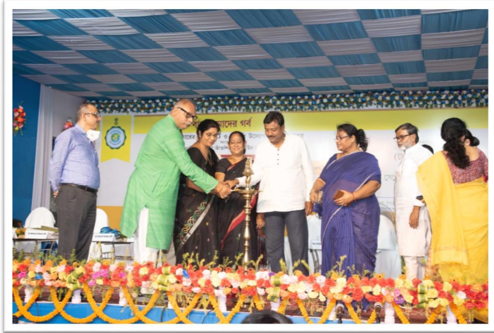
Banglar Tanter Haat-2022-23