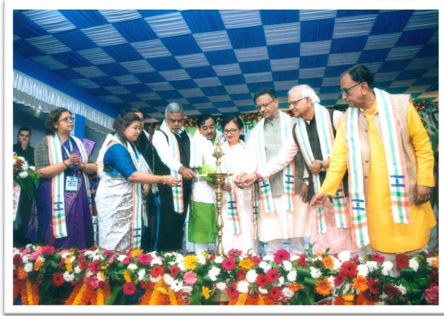
State Level Khadi Mela 2022

As per approval of the Department of MSME&T, Govt. of West Bengal, this office has extended the infrastructure and others logistic support to WBKVIB for organizing State Level Khadi Mela 2022 at Prince Anwar Shah Road, Kolkata from 30.12.2022 to 16.01.2023. Total Rs. 1,07,46,800=00 was placed to WBSEPS for the above purpose by WBKVIB. Out of which Rs. 79,95,727=00 has been utilized and Rs. 27,51,073=00 refunded to WBKVIB during the financial year 2022-23.