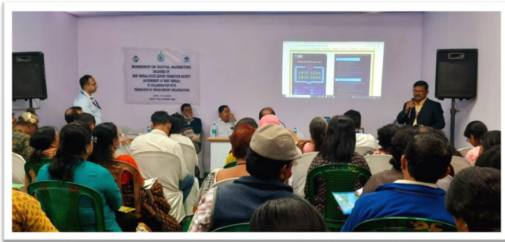
Workshop on Digital Marketing at Kolkata