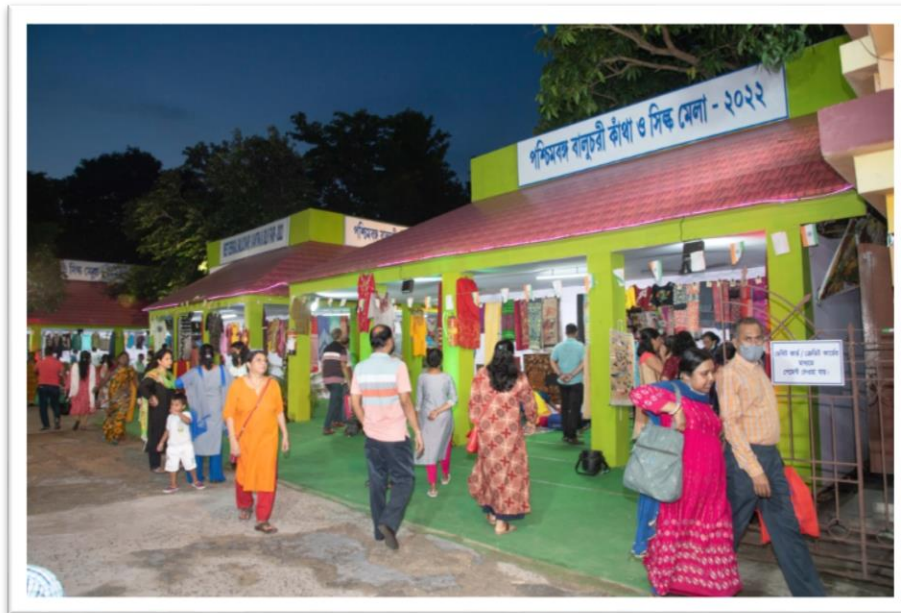
West Bengal Baluchari, Kantha o Silk Fair at EZCC, Salt Lake