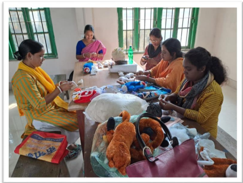
Advance Training Programme on Soft Dolls