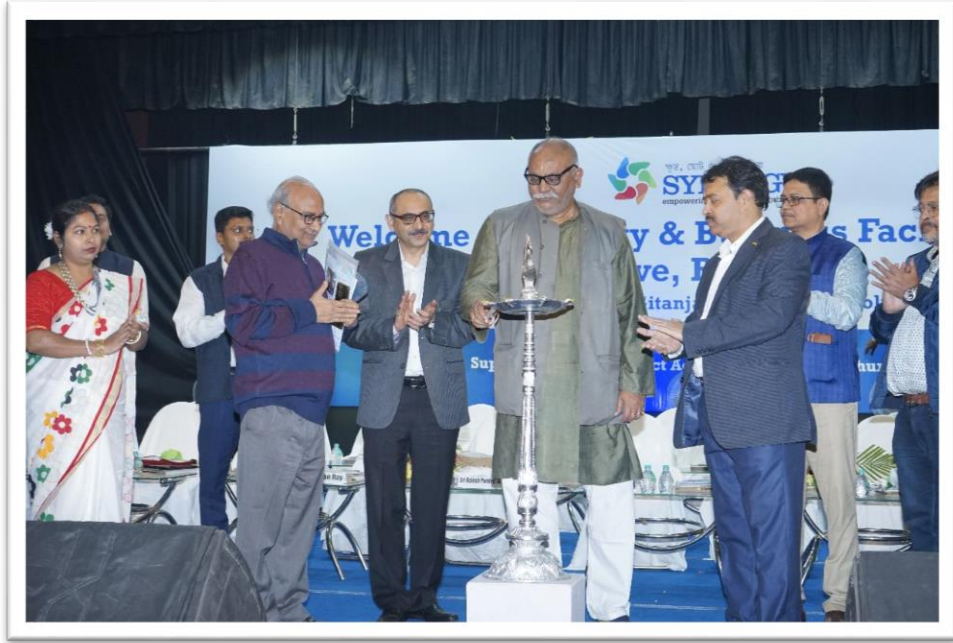
Synergy and Business Facilitation Conclave at Gitanjali Auditorium, Bolpur, Birbhum,