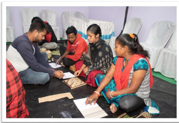
Design Development & Skill Development Programme on Bamboo Craft